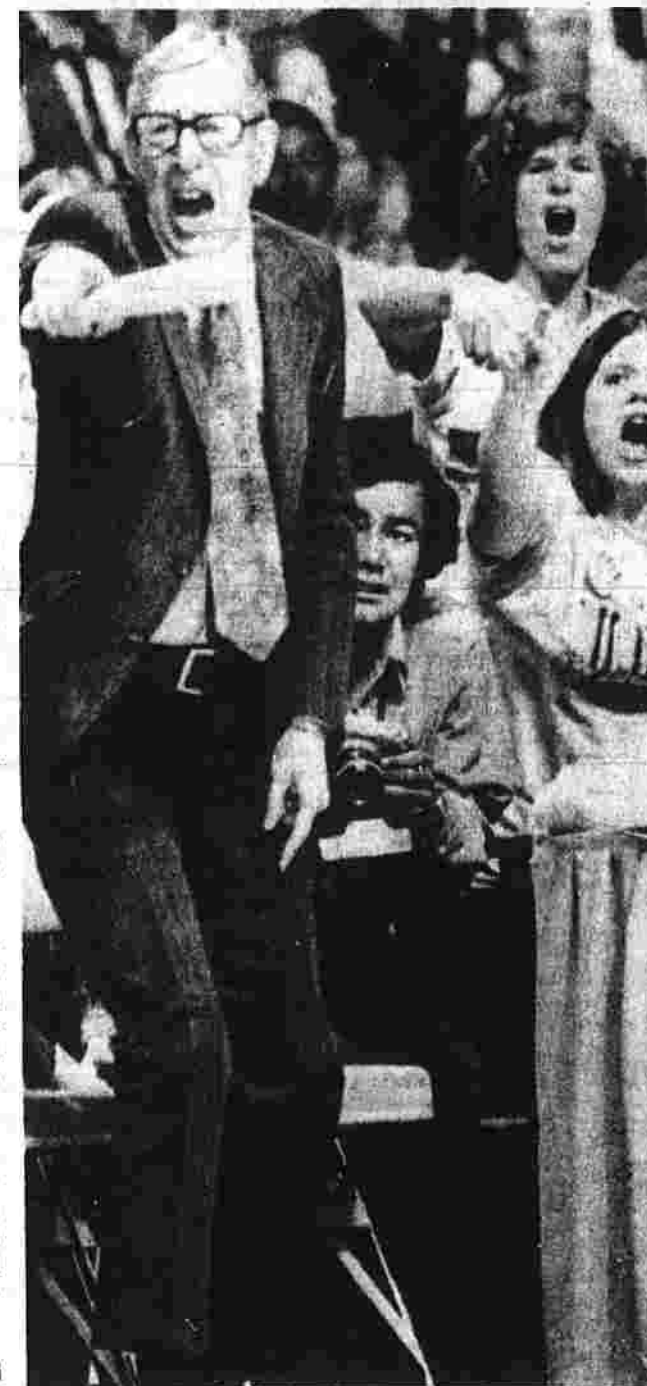
Coach Voices Disapproval UCLA's John Wooden Gets Off Bench